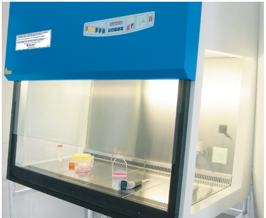
UltraSafe 212D electric sash window cabinet

Gelaire safety cabinets are tested and certified on-site, prior to use by an independent NATA-registered testing laboratory.