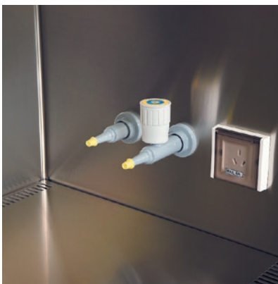
BH-EN work zone