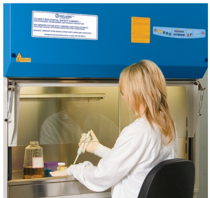
BH-EN2004 hinged window cabinet

ECS® control and energy management the new ECS® (Eco Control System) microprocessor employs the latest technology for integrated management of airflows and filtration. Self-regulation of airflows compensates for gradual loading of filters, while restoring power balance. Combining AC fans and certified low pressure-drop filters, the ECS® system optimises power consumption, thereby reducing CO 2 emissions into the environment.